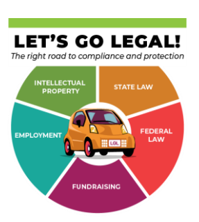
Let's Go Legal: The right road to compliance and protection. Created in partnership with Wayfind.

All of these include videos, guides, games, documents, and tools. Available in the Learning Library: